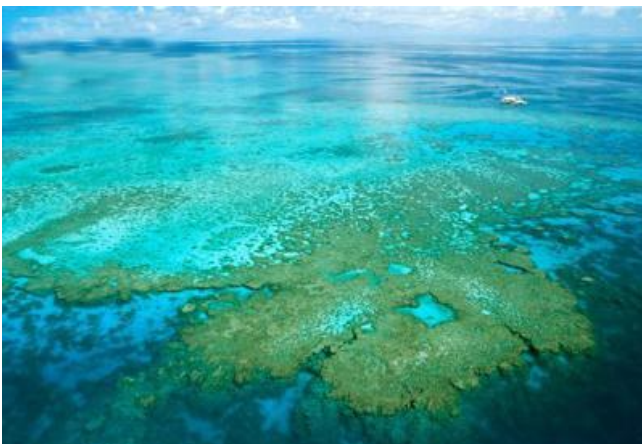
Figure 3 Acidified seawater

Another issue caused by climate change is the acidification of seawater (Figure 3). The increase in atmospheric carbon dioxide ( \text{CO}_2 ) concentration leads to a decrease in the concentration of carbonate ions ( \text{CO}_3^{2-} ) in seawater, affecting the ocean's acid-base balance. Ocean acidification has a direct impact on the symbiotic algae of hard corals.