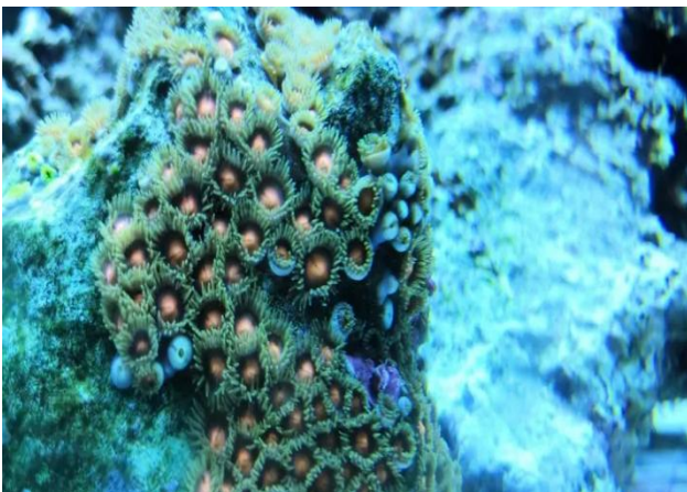
Figure 4 Coral and symbiotic algae

Hard corals and symbiotic algae (Figure 4) can also regulate the rate of photosynthesis to minimize the damage of photosynthetic products to hard corals. Hard corals can adjust the density and pigment content of symbiotic algae to adapt to different light conditions (López-Londoño et al., 2022). This photosynthetic adaptation mechanism helps hard corals mitigate the risk of symbiotic algae being exposed to excessive sunlight while maintaining a sufficient energy supply.