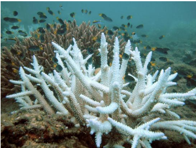
Figure 2 Bleached coral