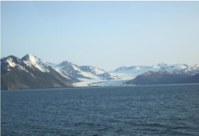
Figure 3 Alaska Sea Area