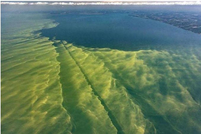
Figure 2 Phenomenon of ocean acidification

Currently, there are over 200 000 known species in the world's oceans, and it is estimated that there may be over 2 million species. However, over the course of approximately 250 years of human activity, humans have already driven at least 15 whale species, 7 dolphin and seal species, over 70 sea turtle species, and other marine organisms to extinction or near-extinction (Lu et al., 2016). According to data from the International Union for Conservation of Nature (IUCN), there are currently seven whale species that are classified as endangered, including the blue whale, fin whale, and Arctic whale. The numbers of these whale species have drastically decreased, with some species having populations of fewer than 500 individuals. The global population of sea turtles is also rapidly declining, with species such as the green turtle, olive ridley turtle, and leatherback turtle being classified as endangered. Global coral reefs face severe destruction and threats, with some reefs being on the brink of extinction. Due to factors like climate change and ocean acidification (Figure 2), the number and coverage of coral reefs are rapidly decreasing, while overfishing and pollution have led to a significant decline in fish populations. It is estimated that one-third of global fish species are threatened by overfishing.