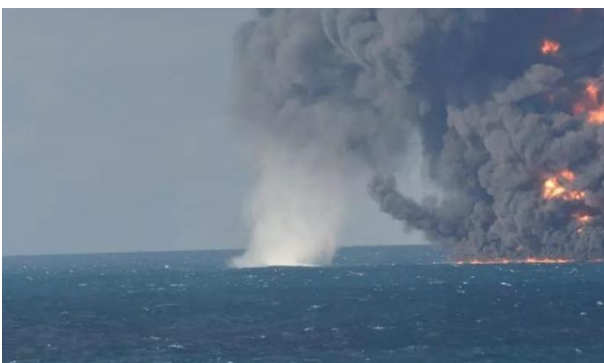
Figure 5 Marine pollution caused by ship explosions

Sediment pollution (Figure 5) is caused by land erosion and human activities. Sediment pollution can result in sedimentation and slowed water flow, thereby impacting the habitats and breeding grounds of marine organisms. Due to large populations and rapid economic development, marine pollution issues are particularly prominent in Asian regions. For example, many coastal cities in China face serious water and plastic pollution, which significantly impact local fisheries and ecosystems. In Europe, marine pollution issues are relatively milder but still exist. The Mediterranean region also experiences significant marine pollution, primarily due to tourism and marine traffic. In North America, marine pollution issues are concentrated around coastal areas near major cities such as Los Angeles and New York, where serious water and plastic pollution problems occur (Siân et al., 2021). Pacific island nations face marine pollution issues mainly due to marine debris and climate change, which have significant impacts on local fisheries and ecosystems. Marine pollution is a global issue, and pollution levels vary across different regions due to factors such as geographical location, economic development, and population size.